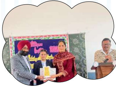
Second Position in English Extempore Competition (Sahodya School Complex Ludhiana, East Zone)