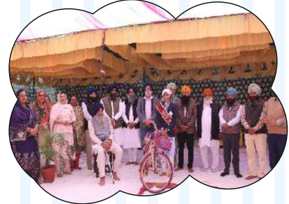
1st Position Moral Value Exam (Guru Gobind Singh Study Circle)