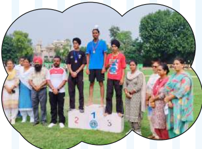
1st Position 100 M under 19 Boys (Zonal Level)