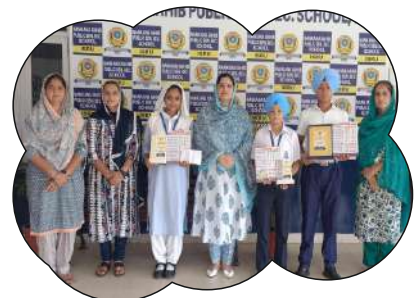
First, Second and Third Position in Dastar Mukabla at Gurudwara Manji Sahib