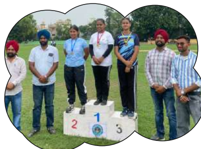
3rd Position under 19 Girls Shotput (Zonal Level)