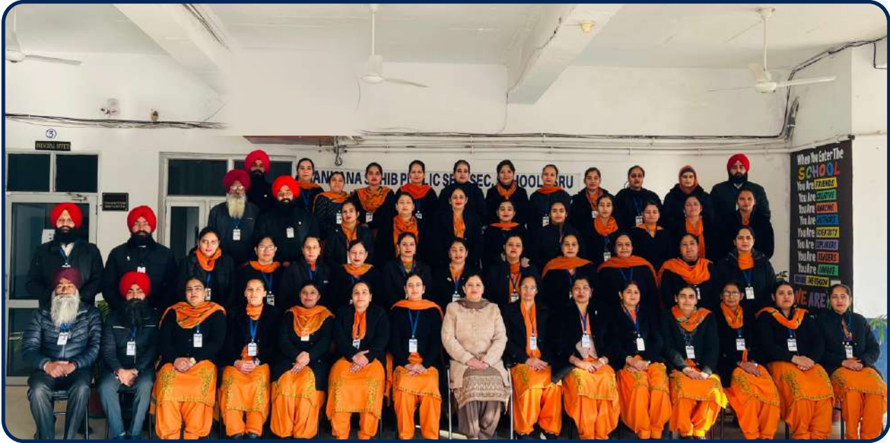
Names Left To Right

“ Coming together is a beginning, staying together is progress and working together is success.” - Henry Ford