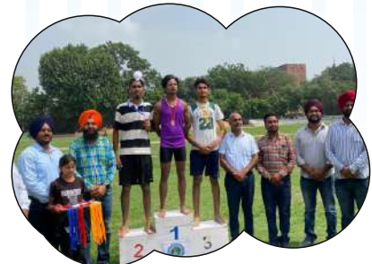
2nd Position under 19 Boys Long Jump Zonal Level