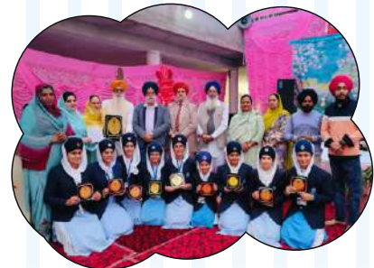
First Position Shabad Gyan Competition at Nsps Ludhiana