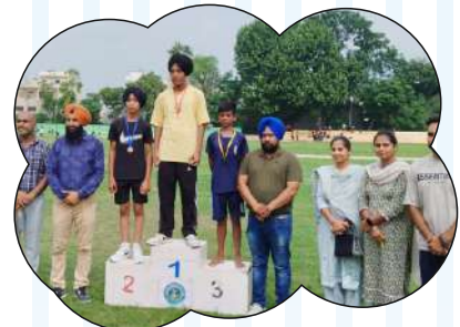
1st Position under 14 Boys 100m Race (Zonal Level)