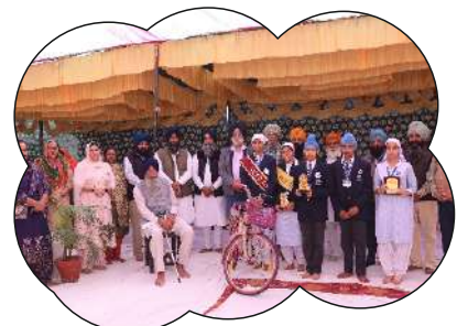
Appreciation Award (Guru Gobind Singh Study Cirle, Ludhiana)