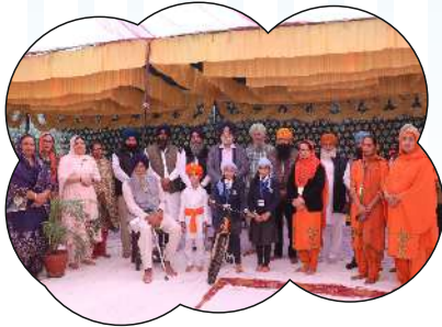
Moral Value Awards (Guru Gobind Singh Study Circle, Ludhiana)