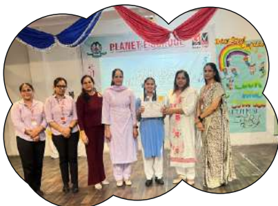
Third Position in Look and Say Competition (Sahodya Inter School Competition)