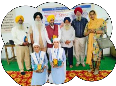
3rd Position in Quiz Competition at Gurudwara Gobind Singh Study Circle, Ludhiana