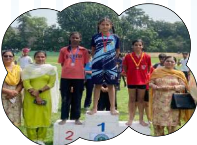
1st Position Under 14 Girls Long Jump (Zonzl Level)