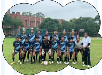
1st Position Football under 19 Boys (Distict Level)