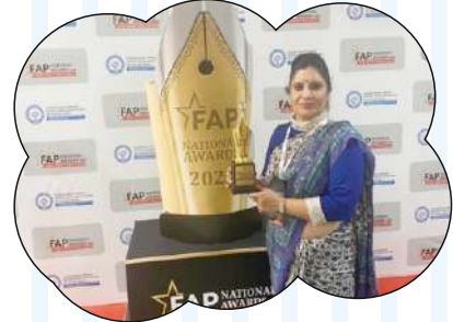
Fap Social Achievement Award (School and Principal)