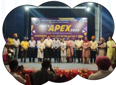
2nd Position in Pencil Shading Competition at GNE Ludhiana