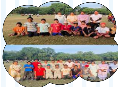
1st Position Long Jump Second Position Weight Lifting (Kheda Watan Punjab Dian)