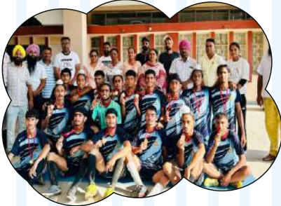
1st Position Football under 19 Boys ( Zonal Level)