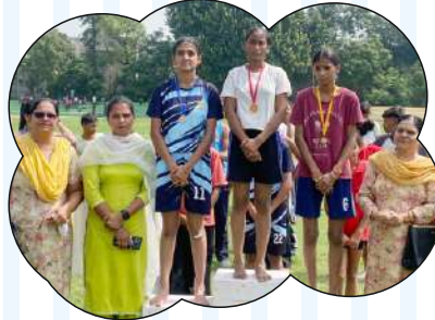
2nd Position under 17 (1500m Race Zonal Level)