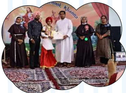
First Position Folk Song Competition (Sahodya Inter School Competition)