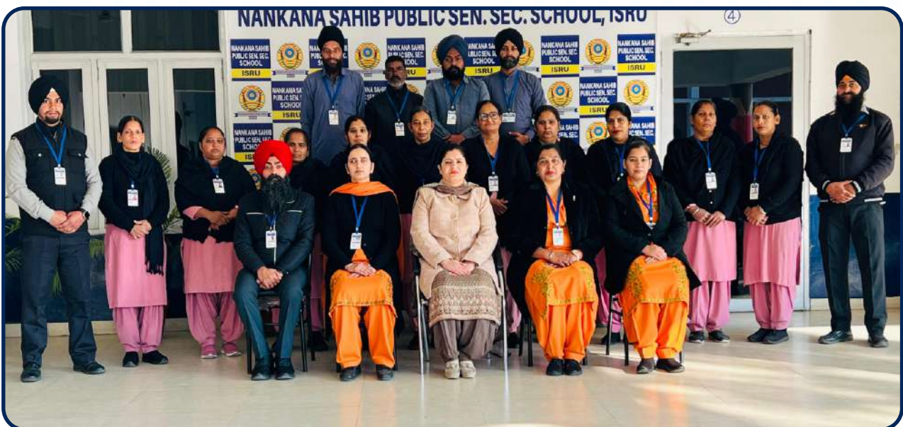
Names Left To Right

“ The strength of the team is each individual member. ” - Phil Jackson