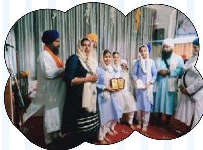
First Position in Quiz Competition at Gurudwara Rara Sahib