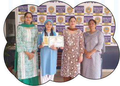
Third Position in Look and Say Competition (Sahodya Inter School Competition) 2