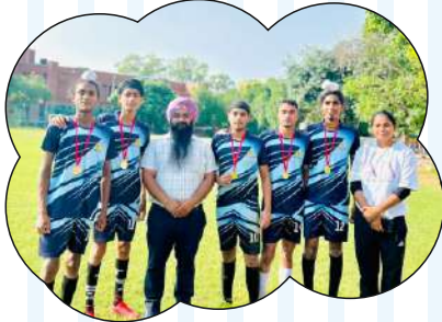
1st Position Football under 19 Boys (District Level)